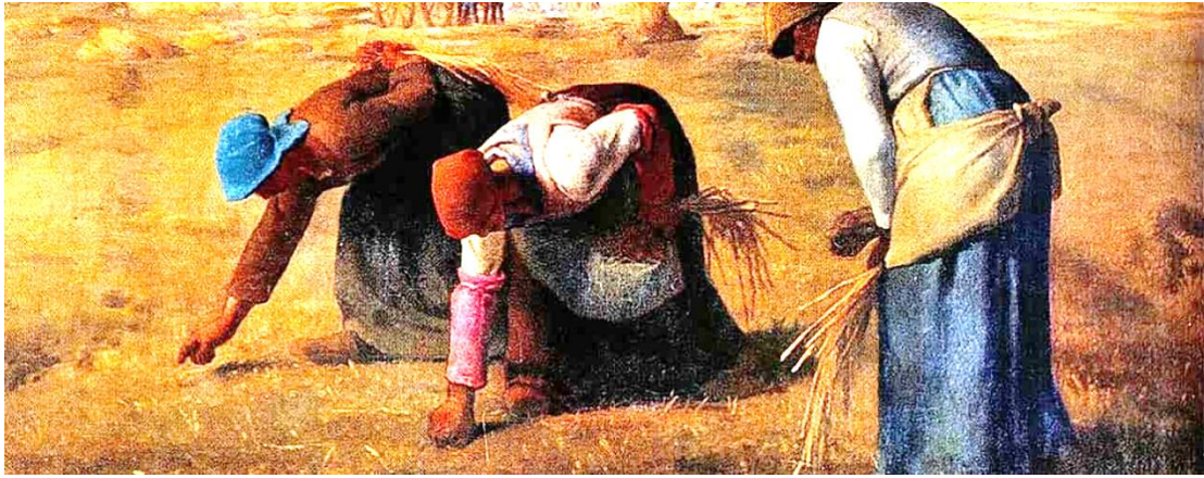
A famous painting - The Gleaners by Jean-François Millet 1857

The practice of picking up “left-overs” in fields is called gleaning. We know that gleaning has been practiced for thousands of years. Gleaning still takes place today to help feed hungry people.