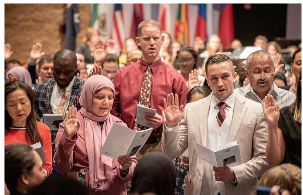
Immigrants becoming citizens of the United States. What do you see?

Think about people who immigrate to this country. Ask your parents or grandparents if they were born in another country and then came here. What was it like for them?