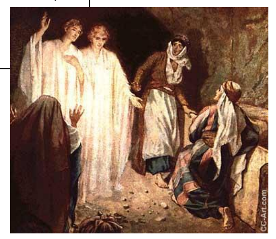
Red Level Revised 2011

But on the first day of the week, at early dawn, they came to the tomb, taking the spices that they had prepared. They found the stone rolled away from the tomb, but when they went in, they did not find the body. While they were perplexed about this, suddenly two men in dazzling clothes stood beside them. The women